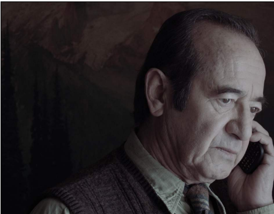
Sergio Hernández as Juan in You'll never be alone

Graduate from the University of Chile in Acting during the year of 1967, early in his career Sergio dabbled in film, theater and television. Being one of the most renowned Chilean film actors, his performances include: "La tierra prometida" (Miguel Littin, 1972), "Diálogo de exiliados" (Raúl Ruiz, 1975), "La Frontera" (Ricardo Larraín, 1991), "Johnny 100 pesos" (Gustavo Graef-Marín, 1993), "La sagrada familia" (Sebastián Lelio, 2006), "Secretos" (Valeria Sarmiento, 2008), "Dawson Isla 10" (Miguel Littin, 2009), entre otras. His latest performances have been Raúl Ruiz's posthumous film "Night across the street" (2012), "No" (Pablo Larraín, 2013, nominated to the Academy Award as best foreign language movie) and "Gloria" (Sebastián Lelio, 2013, Silver Bear award on the 2013 Berlinale). In the field of Theatre it can be highlighted "Fulgor y muerte de Joaquín Murieta" by the Nobel Award Pablo Neruda (1967), "Those who are left on the road" by Isidora Aguirre. Sergio Hernández won the Best Actor Award Altazor 2012. Also, Sergio Hernández was part of the Polish Movement called "Theatre Anthropology" led by Jerzy Grotowski and founded the Wayfarers group that toured Europe and returned to Chile in 1986 presenting "From the darkness, in an act called" at the Trolley Theater, at the heights of Pinochet's dictatorship.