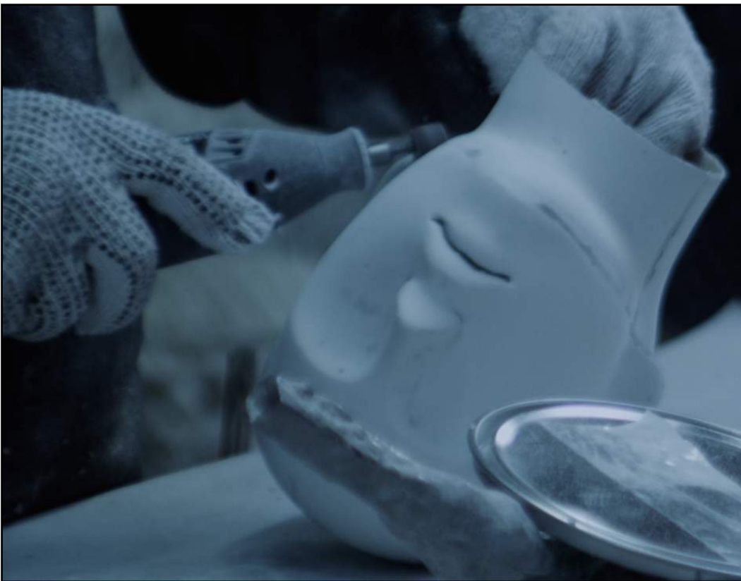
Still from You'll never be alone

“About three years ago, a 20-year-old boy was murdered in Santiago because he was gay. He was tortured for hours: his legs broken, a swastika carved on his stomach using shattered bottles, a piece of his ear torn out. By coincidence, that young boy was a fan of my work as a musician and I knew who he was because we’d spoken a couple of times. I met his family and they urged me to continue “speaking on behalf of boys like him”, not usually represented in the media or even art: in short, a gay and poor kid. This story, however, shifts its focus onto the father of the boy. This is my way of saying: it was not one boy, it’s many boys and girls, and women and men. And the life we should examine more carefully is not the boys’, it’s the rest of us. We who allow this to repeat over and over.”